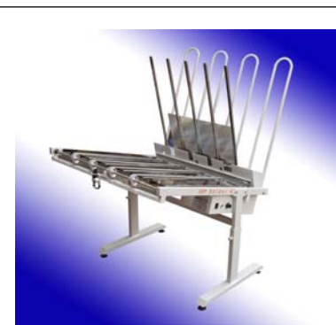
Optional Spider 4/8 Page