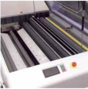
Roller configuration for full series