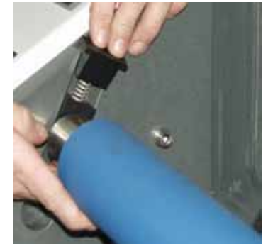
Easy release of all rollers for cleaning. No tools are needed